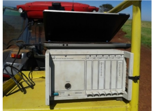
Fig. 3: Data acquisition module MGC Plus.

The lower part of the car presents a test unit comprised by the set of crop rows where the double disc supports were attached, at their respective angle variations. The system used for data collection and acquisition was the MGC Plus by HBM, fed by a direct current unit. The software that read and converted the signals collected for pre- and post-processing was the Catman Easy also by HBM, both secured in the board