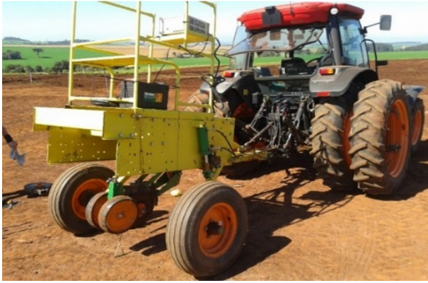
Fig. 2: Dynamometric car and test unit.

between 2 cm and 7 cm. Thus, the soil resistance to the penetration and movement of coulters in this depth limit is influenced especially by clay content, degree of compaction, and moisture content of the soil.