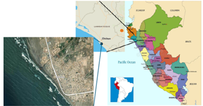
Figure 1. Location of the study area.

The marine-coastal zone of the Santa Rosa District, located along Peru's northern Pacific coastline (Figure 1), is part of a dynamic and ecologically rich region influenced by the Humboldt Current, a cold, nutrient-rich oceanic current that sustains one of the most productive marine ecosystems globally [21]. This area includes important coastal features such as estuarine zones and sandy beaches, which are critical for both biodiversity and economic activities. Santa Rosa, known for its artisanal and small-scale fish processing operations, contributes to Peru's broader fishing industry, particularly in anchovy processing for fishmeal and fish oil-key products in international markets [16]. The ecological significance of this region, combined with intense fishing activity, underscores the need for sustainable environmental management practices [22].