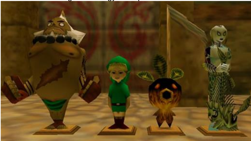
Figure 5 - Elegy of Emptiness' Statues