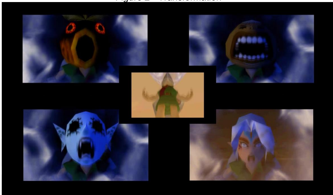
Figure 2 - Transformation