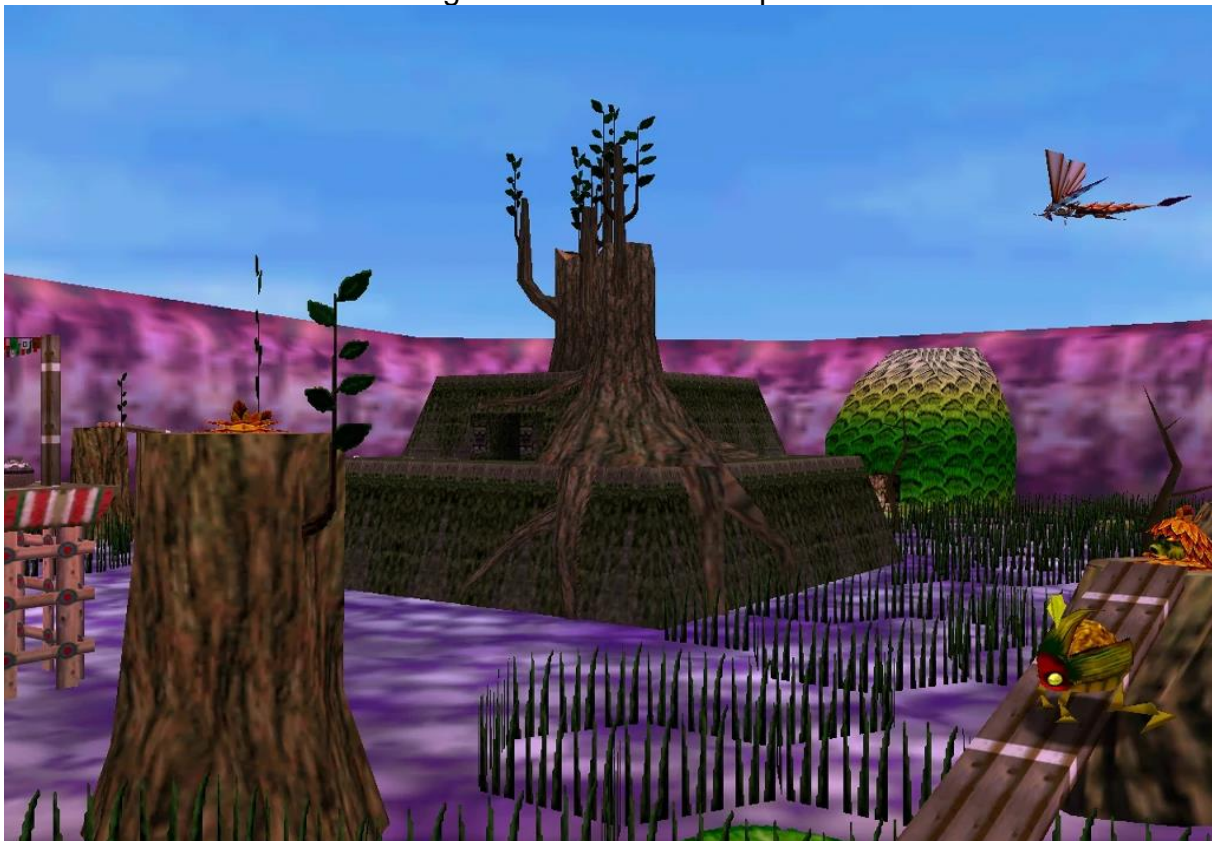
Figure 6 - Woodfall Temple