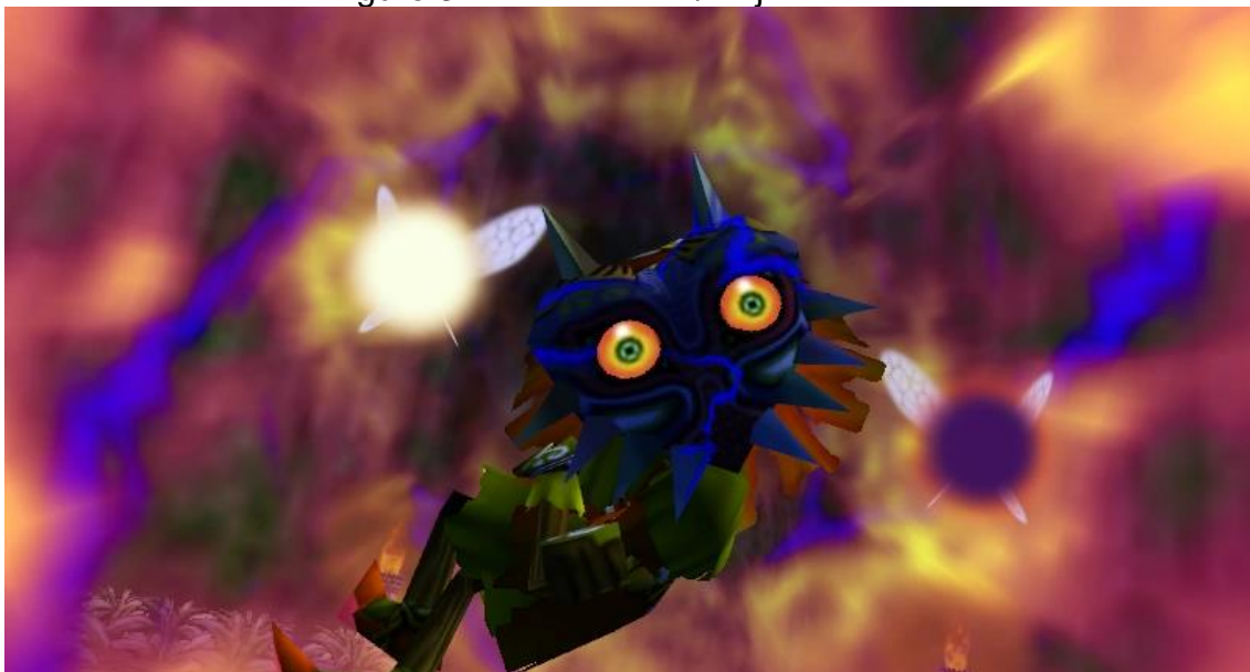
Figure 3 - The Skull Kid/Majora's Mask