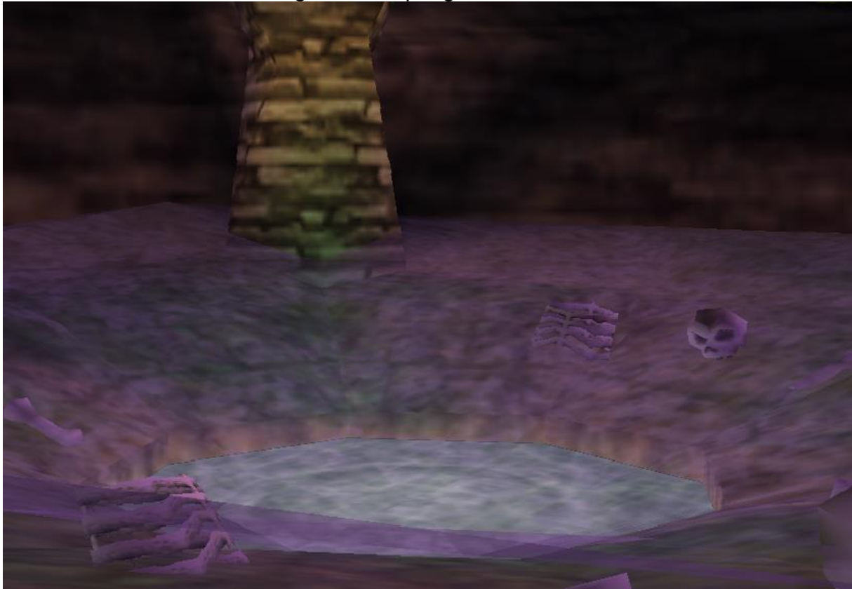
Figure 11 - Spring Water Cave