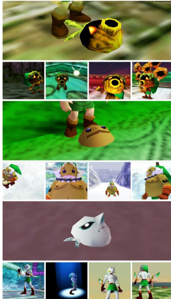
Figure 4 - The masks