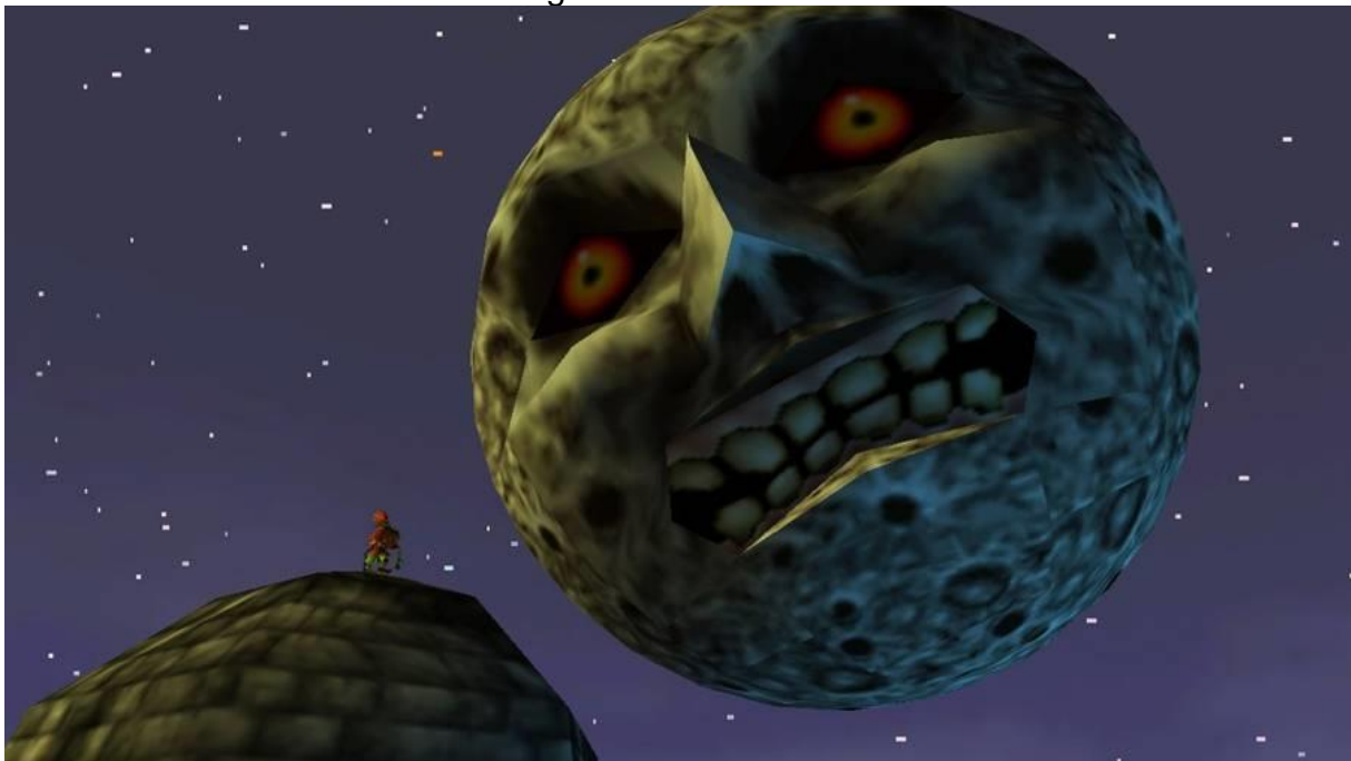
Figure 1 - The Moon