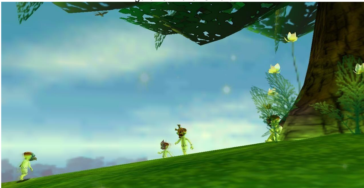
Figure 13 - Lunar Children

Source: The Legend of Zelda: Majora's Mask (2000).