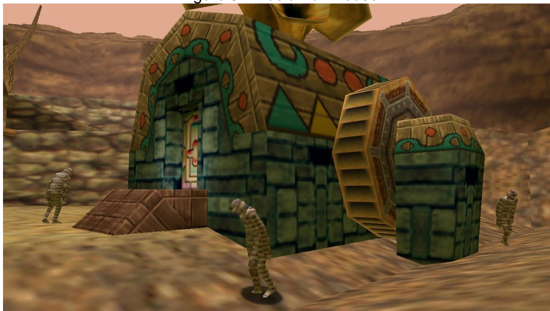
Figure 9 - Music Box House

Source: The Legend of Zelda: Majora's Mask (2000).