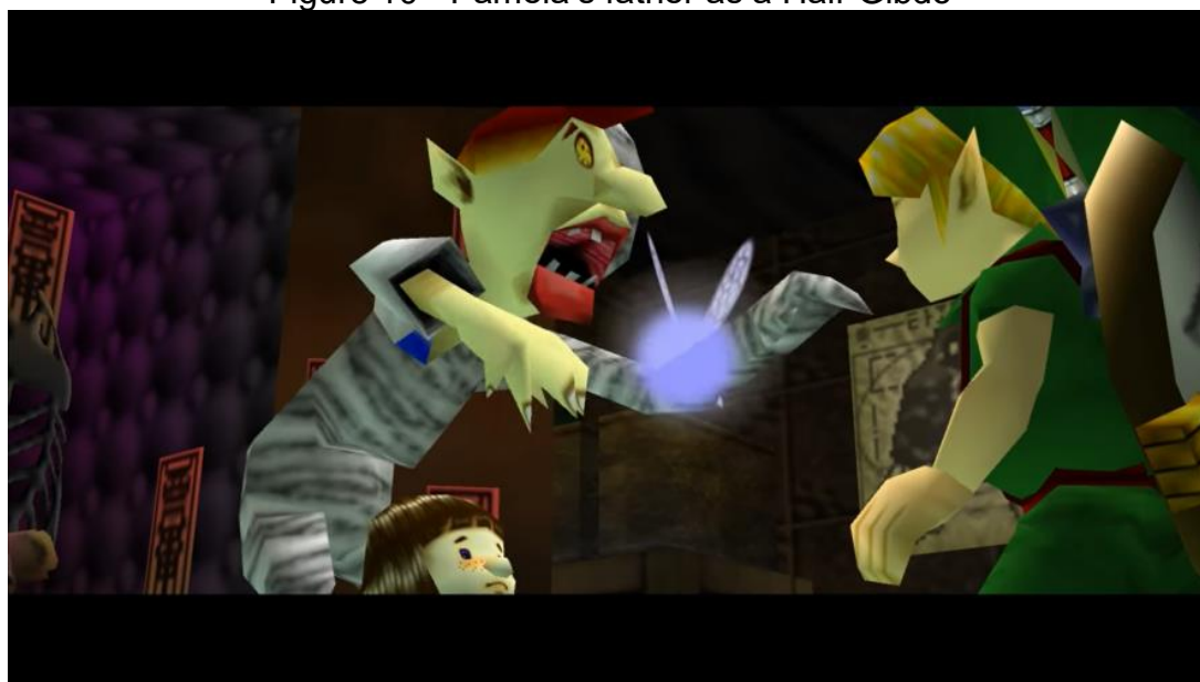
Figure 10 - Pamela's father as a Half-Gibdo

Source: The Legend of Zelda: Majora's Mask (2000).