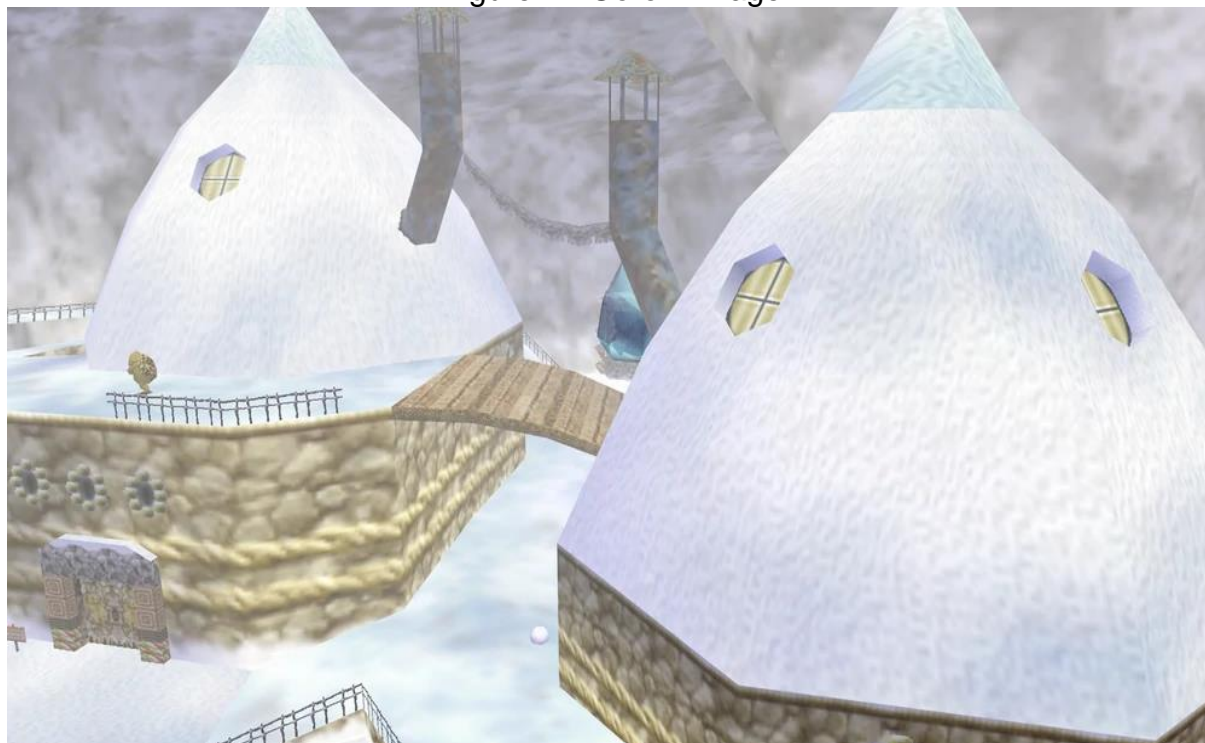
Figure 7 - Goron Village