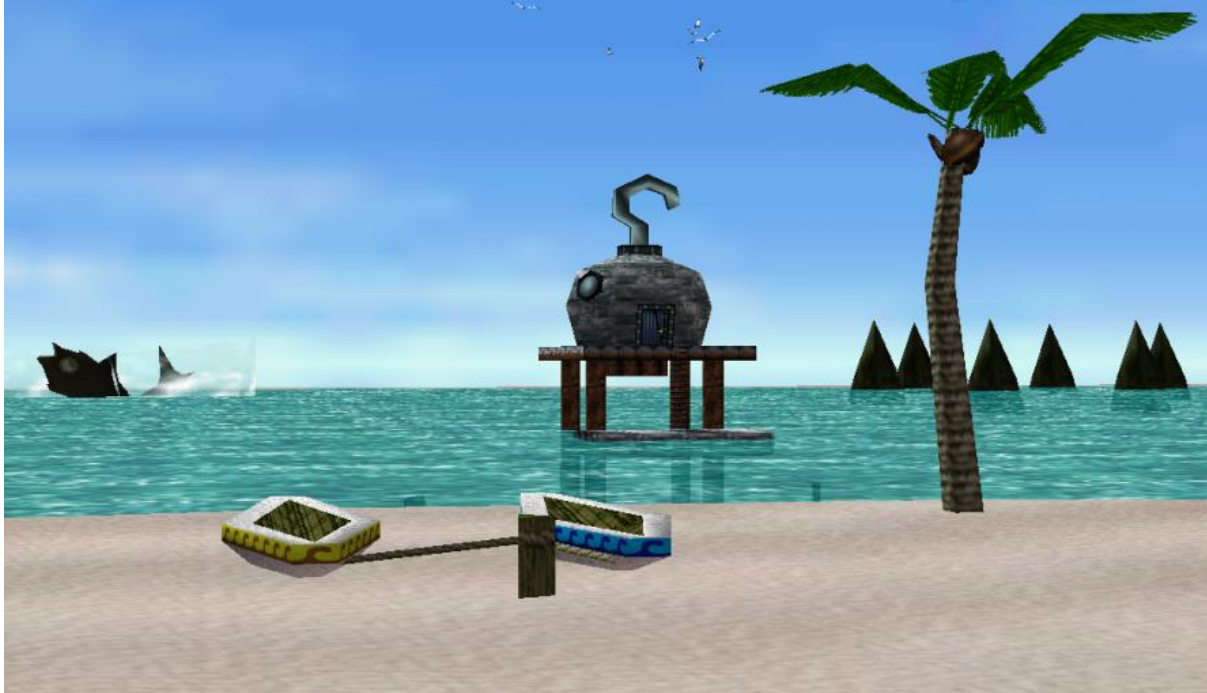
Figure 8 - Great Bay Coast